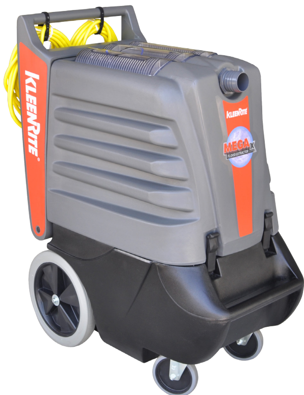
MEGAx model 36305